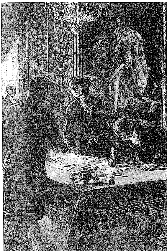
This painting shows Americans James Monroe and Robert Livingston and the French Finance Minister signing the Louisiana Purchase treaty in 1803. As one historian noted, the transaction enlarged the size of the United States by "about 140 per cent," adding 50,000 new citizens and some 150,000 Native Americans to the national realm.

erson, however, left nothing to chance. Regularly working 10 to 13 hours a day to ensure that his wishes were carried out, he became the most powerful party leader in the republic's short history. Such a regimen left, according to this remarkably organized man, "an interval of 4 hours for riding, dining, and a little unbending." Even then he used the dinner hour several times a week to invite congressional members, stoke them with excellent food and wine and, as Jefferson